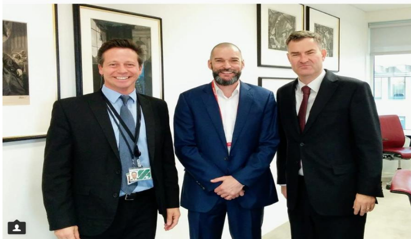
Fred Sirieix on twitter and Instagram

We just wanted to showcase some of the developments within the hospitality and catering sector happening across the prisons.