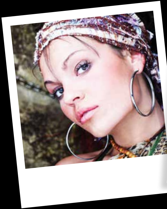
Image courtesy of iStockphoto.com/Aldra (left) Image courtesy of iStockphoto.com/kaisphoto (right)