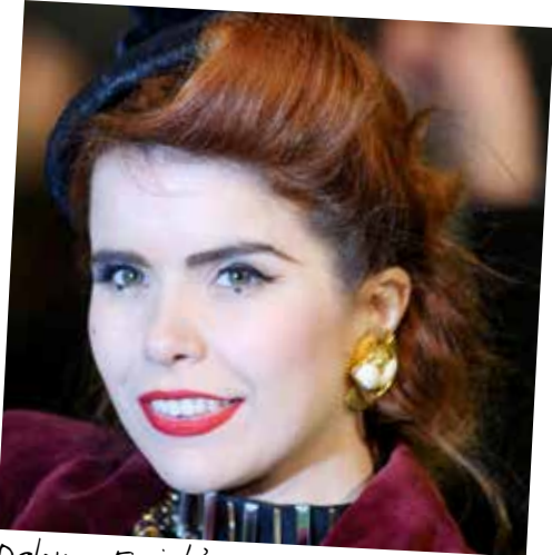
Paloma Faith's earrings complete her quirky look.