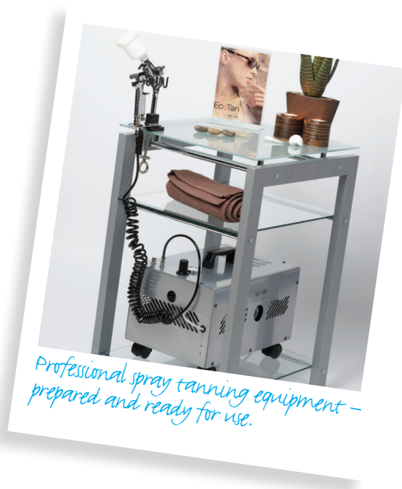
Professional spray tanning equipment - prepared and ready for use.