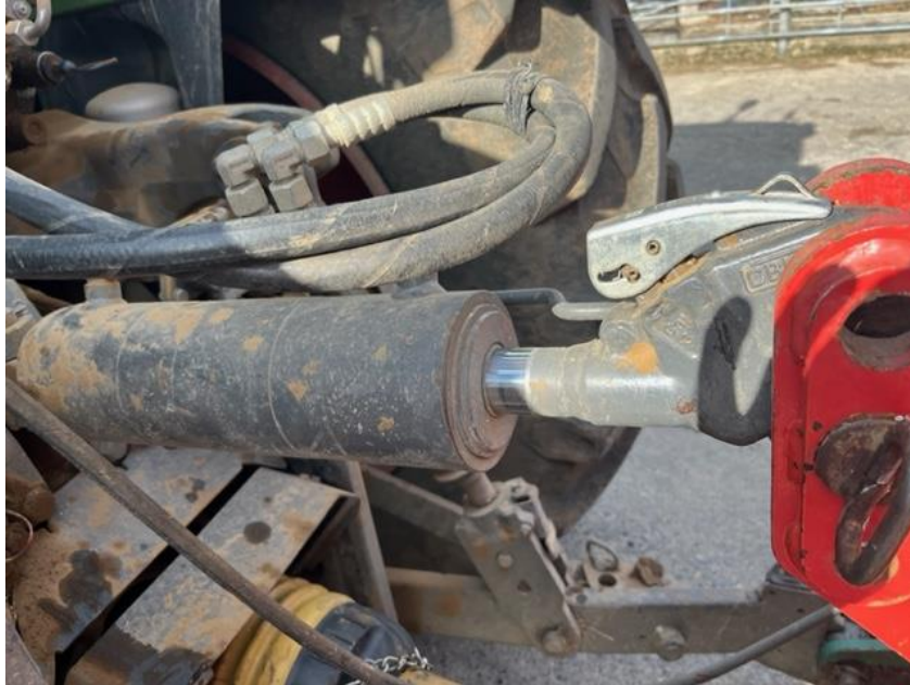
Photo 12 (assessor) Cultivation depth: hydraulic top link too short