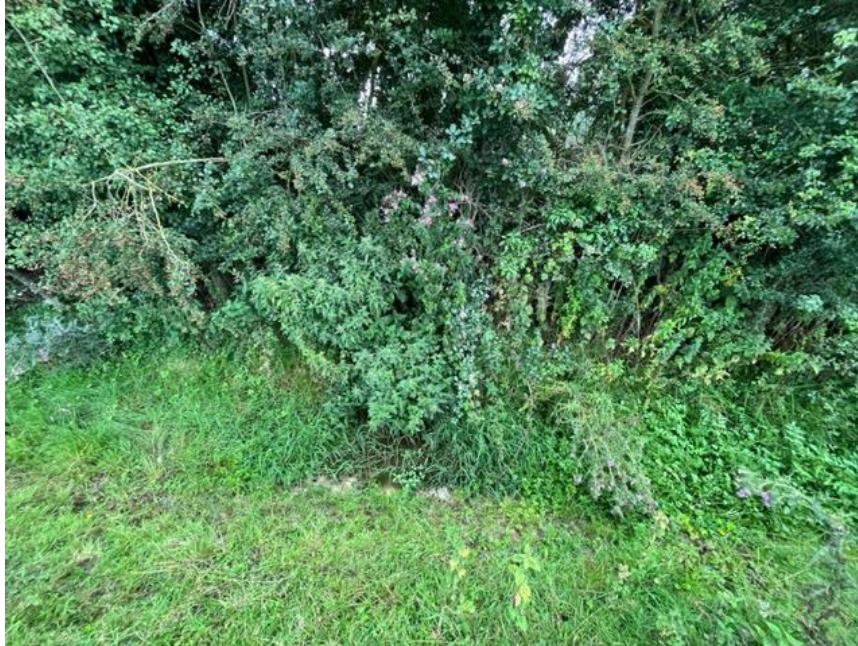
Photo 1 (assessor) Before the candidate has undertaken the task: whole area