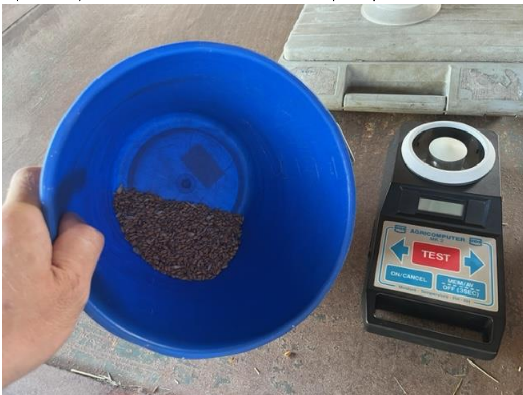
Photo 1 (assessor) Collection and assessment of the crop sample: visual assessment