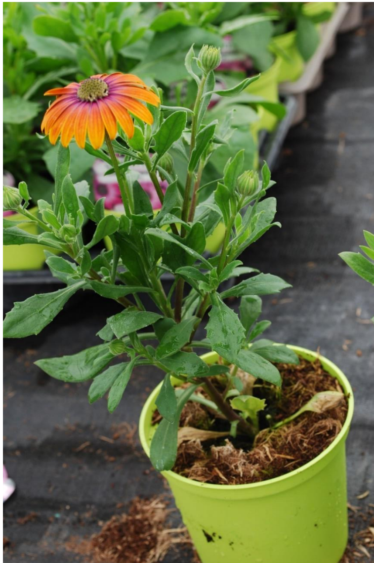
Photo 1 (assessor) One plant before the candidate starts the task to show example of plant condition