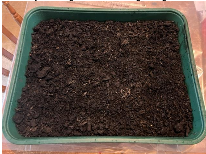
Photo 1 (assessor) Seed tray showing the level of the growing media