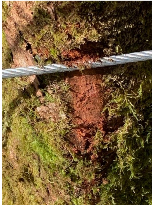
Above: damage to standing tree caused by routing of cable