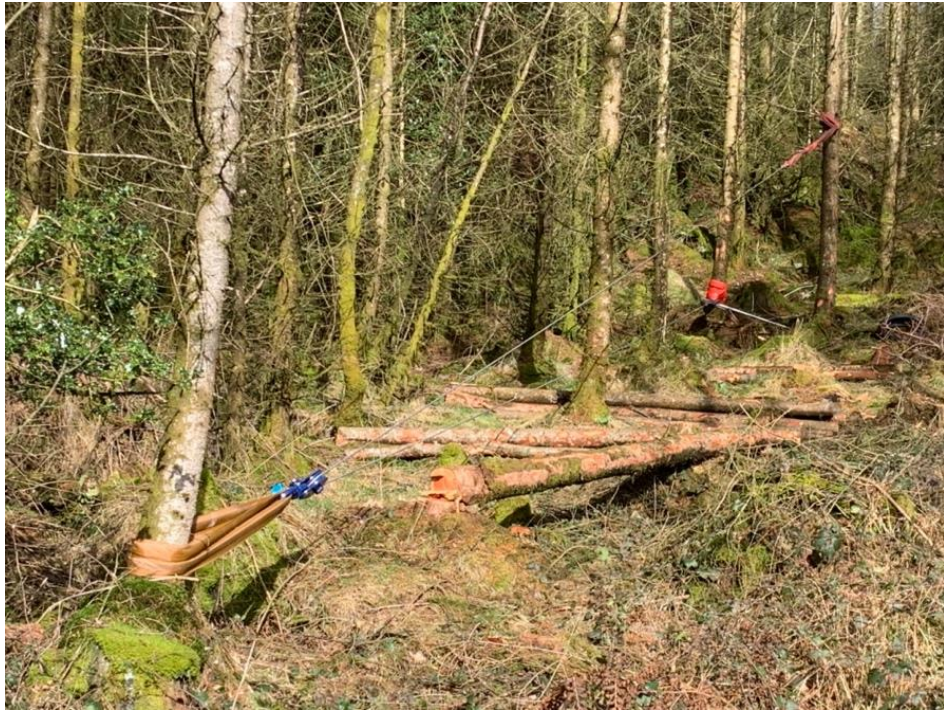
T Level Technical Qualification in Agriculture, Land Management and Production - Tree and woodland management and maintenance (Forestry pathway) GSEM Threshold competence