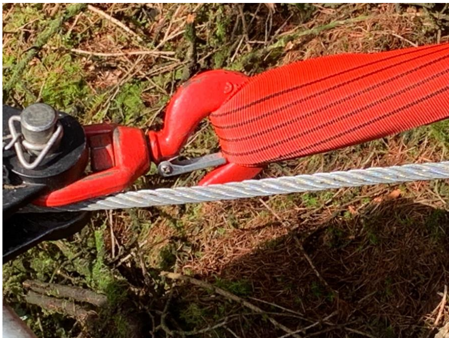
Above: Winch connected directly to sling with no shackle

T Level Technical Qualification in Agriculture, Land Management and Production - Tree and woodland management and maintenance (Forestry pathway) GSEM Threshold competence