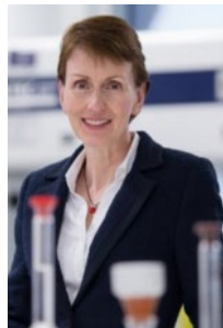
Helen Sharman Back from space and now

We travelled to the space station in a space craft from the 1960s. After we arrived, our contact with Earth was only for a few hours a day.